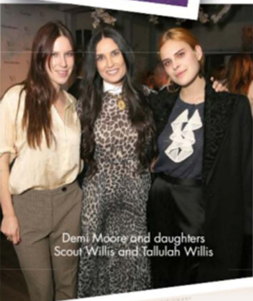
Demi Moore and daughters Scout Willis and Tallulah Willis

Visionary Women is an LA non-profit organization dedicated to advancing the status of women. Recently they honored actress and activist Demi Moore with the inaugural "Visionary Woman" award for her commitment to combating human trafficking and helping to eliminate child sex slavery through her work with Thorn, a nonprofit organization she co-founded. To date, Thorn's work has led to the arrest of 6,500 child sex traffickers.