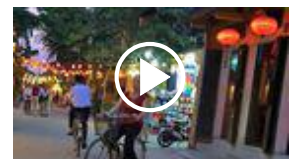
Biking in Hoi An Feb 17, 2018