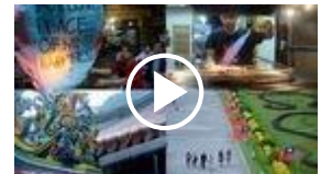
In Taipei, several sensory adventures lead to a fiery lantern launch Jan 17, 2018