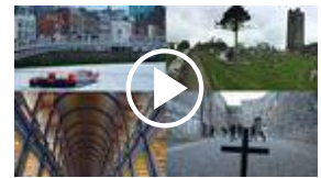
For St. Patrick's Day, a Dublin trio Mar 13, 2018

This video zips through Dublin, including one of its most gorgeous addresses (the library that holds the Book of Kells) and one of its grimmest (the Kilmainham Gaol). We wind up on a hilltop in County Meath where St. Patrick is said to have lit an Easter bonfire 16 centuries ago.